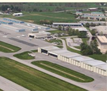
Skytech, inc. (DMW) 200 Airport Dr. Westminster, MD 21157