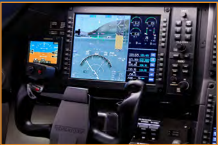
SmartView Synthetic Vision on the Honeywell Apex Avionics System gives the pilot a clear view of any obstacles.