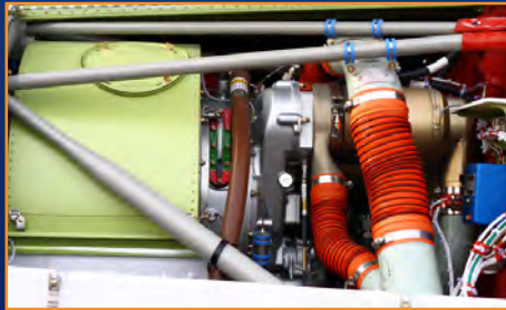
Redundant Accessory Systems are easily accessible by both crew and maintenance departments.