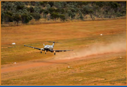
Phenomenal runway performance & certification for unimproved strips adds to operating envelope and safety margins.