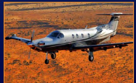
A stick pusher won't allow the airplane to stall by actively reducing the Angle of Attack.