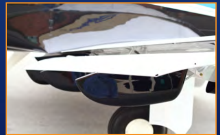
Fowler flaps give excellent control at slow speeds and allow for easy operations at smaller runways.