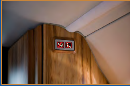
Safety features throughout the cabin and a PA announcement system give crew and passengers a direct link.