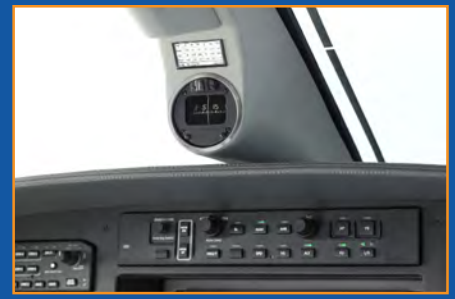
A fully-coupled digital autopilot reduces pilot workload.