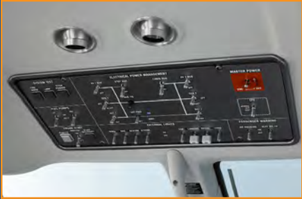
Overhead controls for systems are laid out in an easy to read format.