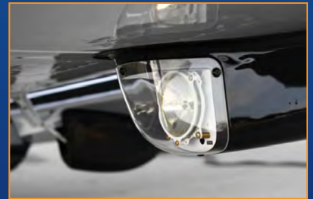
Fog penetrating blue recognition lights have a 2500 hour life expectancy.