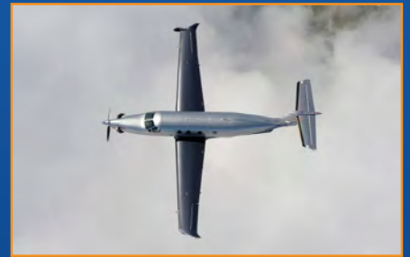
An efficient wing works well both at altitude and in the pattern with slower traffic.