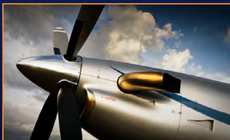
The Pratt & Whitney PT-6 engine is legendary for its dependability.