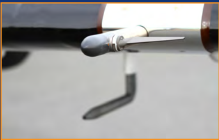
Two independent Angle of Attack (AOA) probes give pilots accurate attitude data in every flight phase.