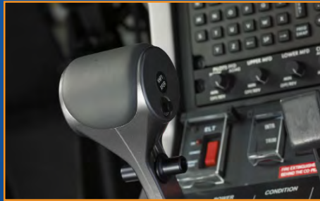
A single Power Control Lever simplifies engine management and provides easy application of reverse thrust for landing.