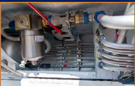
Externally located fuel lines with a dedicated maintenance shut-off are one example of the attention to detail.