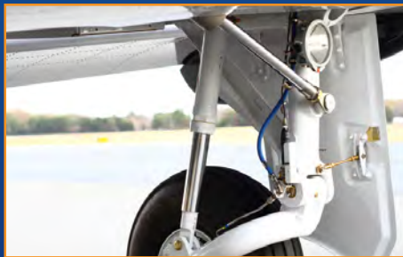
Rugged trailing link landing gear can operate on many surfaces and make for supremely soft touchdowns.