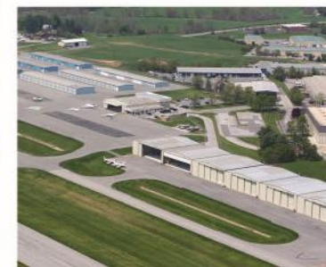
Skytech, inc. (DMW) 200 Airport Dr. Westminster, MD 21157