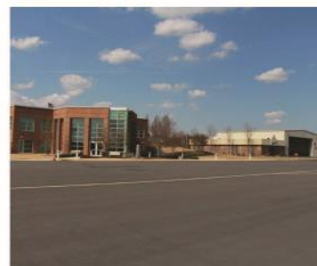
Skytech, inc. (UZA) 550 Airport Road Rock Hill, South Carolina 29732